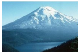
Before the eruption in 1980

Mount St Helens is a volcano in Washington State, USA . It used to be shaped like a cone but after it erupted in 1980 , the top was blown off the volcano. Height 2,549 metres . Recent eruptions 2004-2008