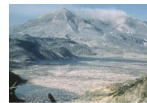
After the eruption in 1980