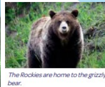
The Rockies are home to the grizzly bear.

North America has many amazing physical features , including Niagara Falls, the Grand Canyon and the Rocky Mountains– the longest mountain range in North America.