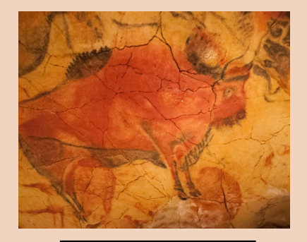
Stone Age cave painting